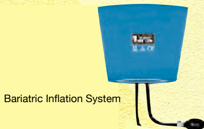
Bariatric Inflation System

For more information on the complete line of Baumanometer® Calibrated® V-Lok® Inflation Systems, call toll-free 1-888-281-6061 or email at info@wabaum.com